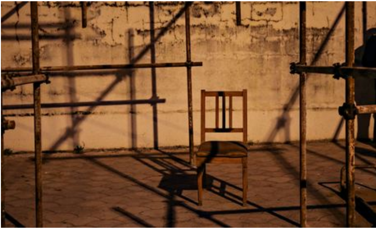
The chair on the

gallows.