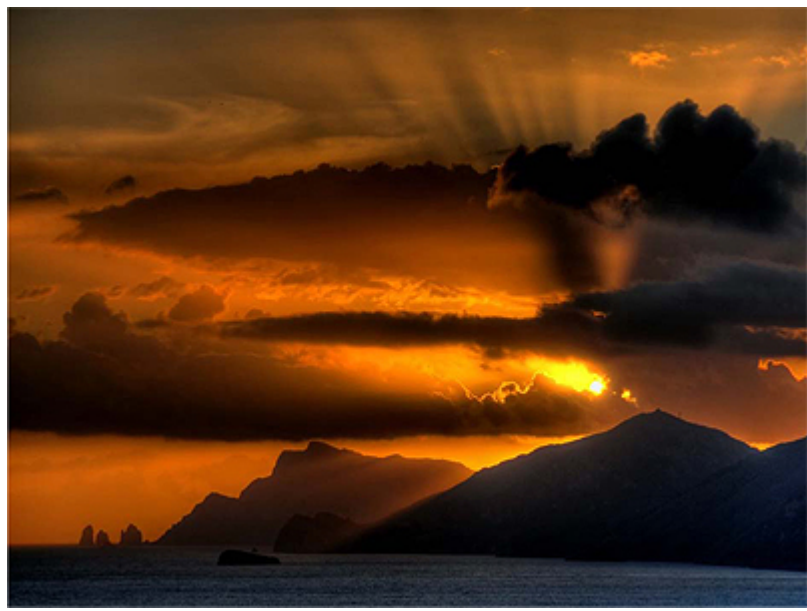
"You are the light of the world"

Already, lighter mornings, lighter evenings. First signs of spring and the promise of longer days, more light, more sunshine, more warmth, new life. And how it raises our spirits, disperses the gloom, gives us fresh impetus and encourages us to renewed vigour in our daily routine. The coming of the light really does have a very positive effect on us. One can hardly imagine how the miners trapped underground for six weeks in Chile must have longed for light, or even how the people who live within the Arctic Circle must long for an end to the perpetual gloom. But we all need periods of darkness to enable us to fully appreciate light, its absolute necessity in our lives and its incalculable worth.